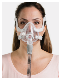
Full Face Mask