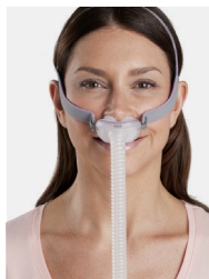
Nasal Pillow Mask